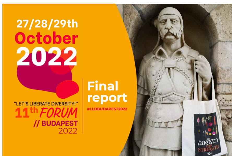
Fig. 1- Final report of the 11th LLD Forum, downloadable at this link:

The EC-LLD board, considering the importance of the event, also decided to find funds to pay for a second person - part-time for 4 months - to help the Secretariat with the organisation for a successful meeting.