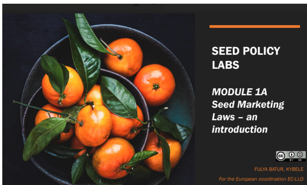
First slide of the Seed Policy Labs (MODULE 1A).